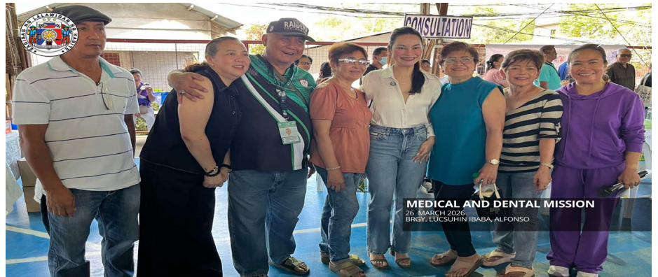
MEDICAL AND DENTAL MISSION 26 MARCH 2026 BRGY. LUKSUHIN IBABA, ALFONSO

A successful medical and dental mission was conducted in Luksuhin Ibaba, Alfonso, Cavite on